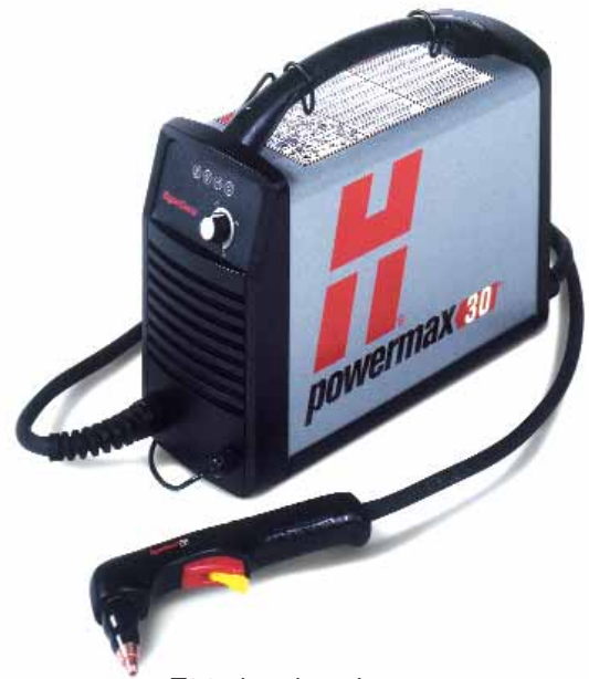
T30v hand torch